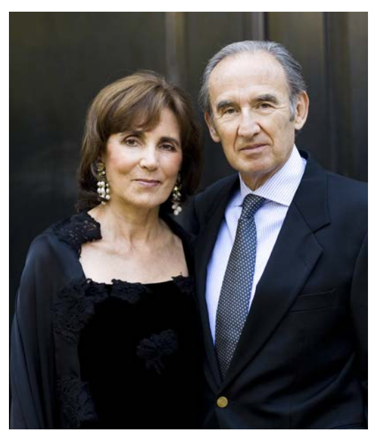
The Catenas' charitable donations include food, land and scholarships.